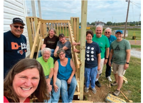
FCC Paducah joined other Fuller Center volunteers to build a new home on a site impacted by the 2021 tornado in Mayfield.

I n September and October, gifted and hard-working Disciples in the West Area have been rolling up sleeves and grabbing hammers, saws, and paint brushes to help neighbors and expand our ministries together.