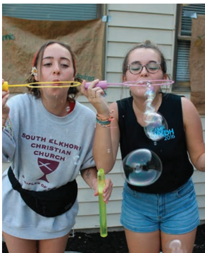
There is never a dull moment at Camp Wakon' Da-Ho.