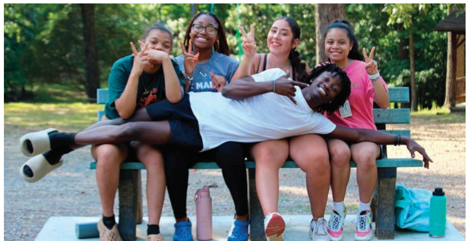
Our campers build connections that can last a lifetime.