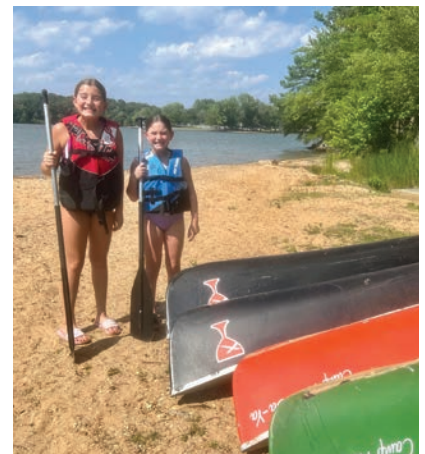
All smiles when canoeing at Camp Kum-Ba-Ya!