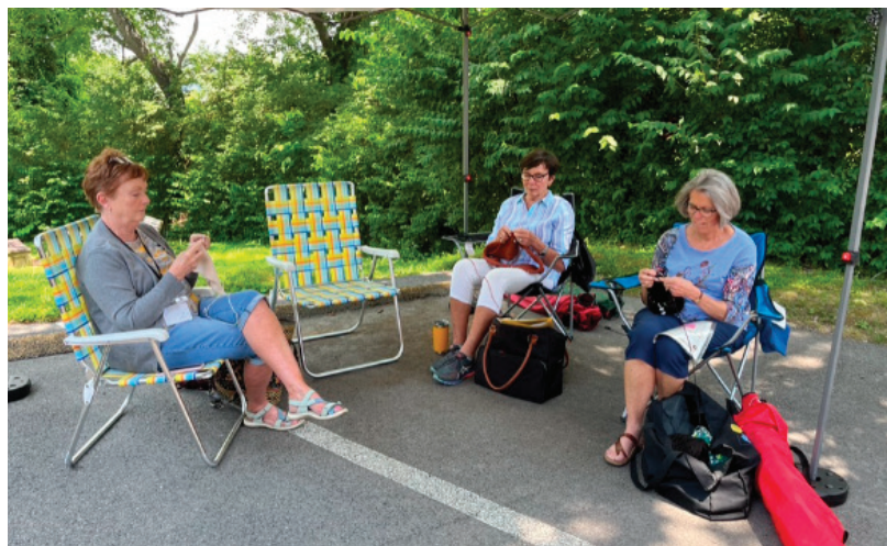
Crafters at work at the 2023 Quilter's Retreat in Berea.